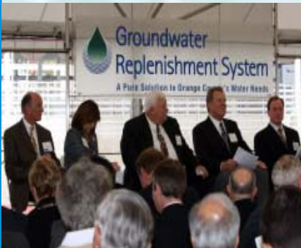
GWR System Dedication Ceremony