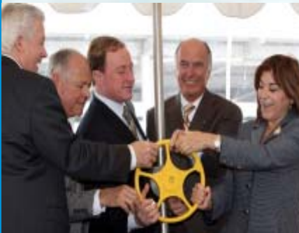
GWR System Dedication Ceremony