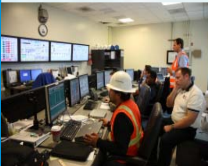
GWR System Process Control System