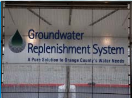
GWR System Dedication Ceremony