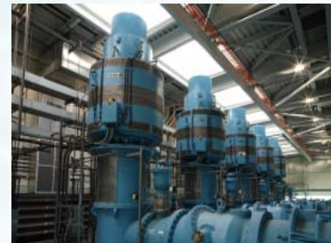
RO Transfer Pump Station