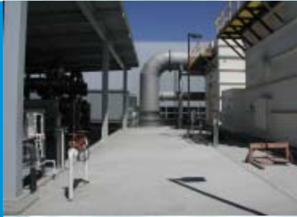
Decarbonator Feed Pipe