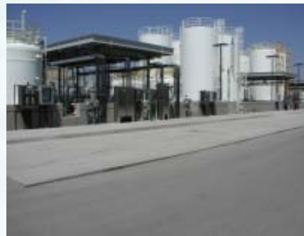
Chemical Loading Area