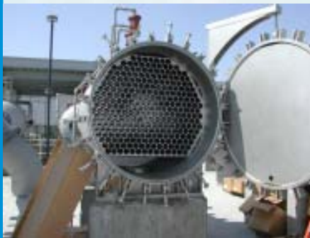
Cartridge Filter Housing