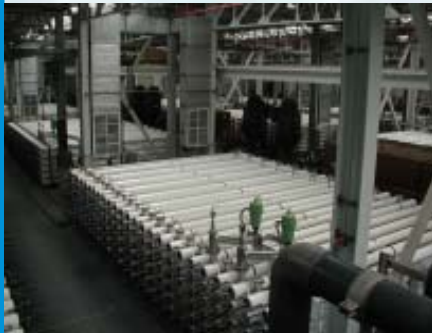
Reverse Osmosis Building