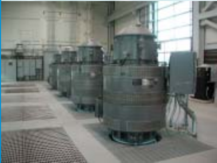
Barrier Pump Station