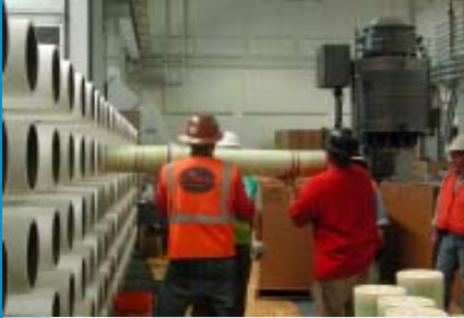
Reverse Osmosis Membrane Installation