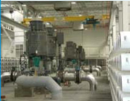
High Pressure Reverse Osmosis Feed Pumps