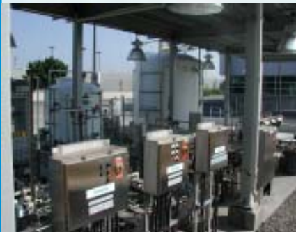
Microfiltration Clean In Place Equipment