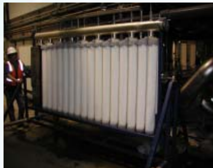
Microfiltration Membrane Modules