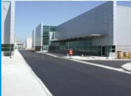
AWPF Product Water Pump Station