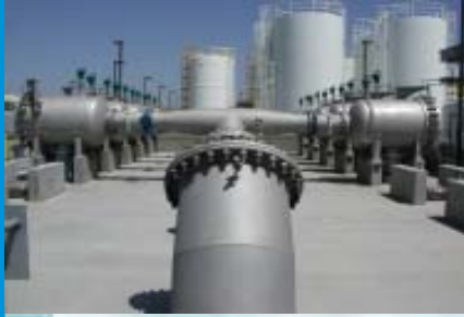
AWPF Cartridge Filters