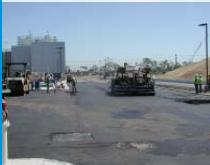
AWPF Final Paving