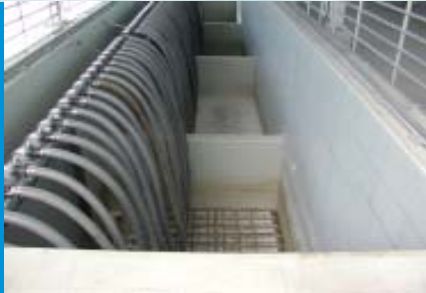
AWPF Microfiltration Cell Backwashing