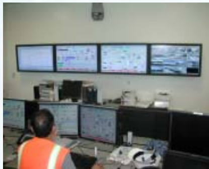
AWPF Control Room