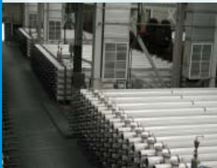
AWPF Reverse Osmosis Train