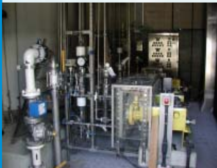
AWPF Hydrogen Peroxide Metering Pumps