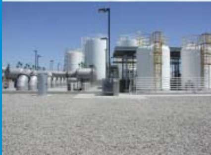
AWPF Cartridge Filters and Chemical Storage Area