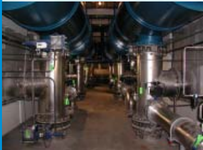
AWPF Microfiltration Feed Piping