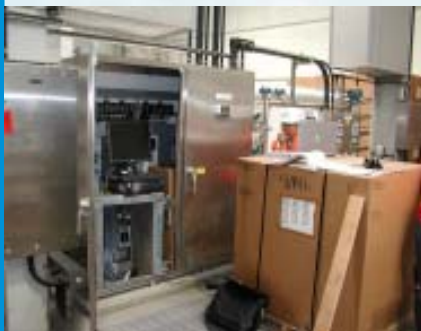
AWPF Reverse Osmosis Train Control Testing