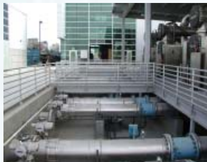
AWPF Ultraviolet Light Feed Piping (Foreground) and Reverse Osmosis Building (Background)

The AWPf contractor continues finish work on the east and west side microfiltration buildings. Commissioning activities have been completed on the microfiltration filtrate, waste backwash and backwash pumps in the microfiltration east and west galleries. Commissioning on the fill and drain system for train A (eight cells) in the microfiltration area has been completed and membranes have been installed in two of the cells. Full commissioning and start-up of the two microfiltration cells has recently begun. Full commissioning activities have been completed on all high pressure reverse osmosis feed pumps and functional acceptance testing has been completed on two of the 5 million gallon per day trains. This functional acceptance testing tests will be replicated on the remaining trains until all 15 have been completed. The control room has been set up with the permanent computers and commissioning activities are being performed from that location. The UV software system is currently being merged with the main AWPf system and initial results have been very positive. Plant start-up and overall project completion is scheduled for November 2007.