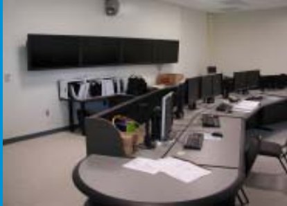
AWPF Control Room