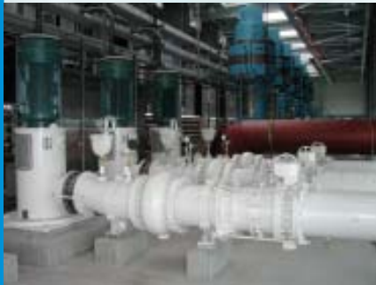
AWPF Microfiltration Backwash and Reverse Osmosis Transfer Pumps