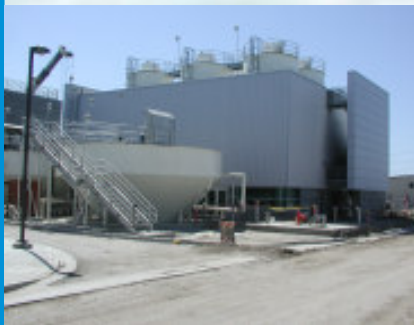
AWPF Lime System

The AWPf contractor continues finish work on the east and west microfiltration buildings. Hydrostatic testing of piping is taking place in the east and west microfiltration galleries. Commissioning activities on the microfiltration filtrate pump system continues in the west microfiltration galleries. Commissioning activities on the control valves in the reverse osmosis area has been completed. Electrical testing of switchgear, motor control centers and variable frequency drives continues throughout the facility in all areas. Energization of transformers and motor control centers has taken place throughout the entire facility. The control room has been set up with permanent computers and communication with the computers has been established throughout the facility. Commissioning activities at the air gap pump station and screenings facility have recently been completed. Concrete curb and gutter and final site paving has recently been completed. Plant start-up and overall project completion is scheduled for November 2007.