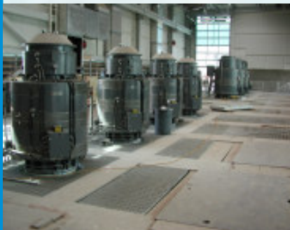
AWPF Barrier & Product Water Pumps