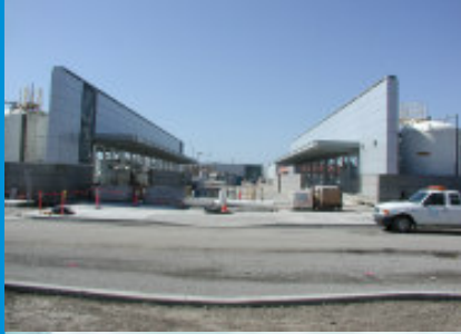
AWPF Microfiltration Area (East & West)