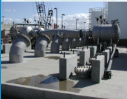
AWPF Cartridge Filters

The AWPf contract includes all structures, piping and facilities that are within the boundaries of the OCWD and OCSD treatment site located at Ellis Avenue and Ward Street in Fountain Valley. Facilities include the Screening Facility at OCSD's Plant No. 1, the 96-inch diameter influent pipeline from the Screening Facility to Microfiltration Facility, Microfiltration Facility (86 mgd filtrate), Microfiltration Break Tank, Reverse Osmosis Facility (70 mgd permeate), UV System (70 mgd product), Chemical Feed/Lime Stabilization System, Product Water/Barrier Pump Station, and all yard piping. Included in the AWPf contract will be all electrical, instrumentation, and process control systems (PCS) associated with each facility. The MF and UV equipment was pre-selected by the District and their contracts were assigned to the Contractor.