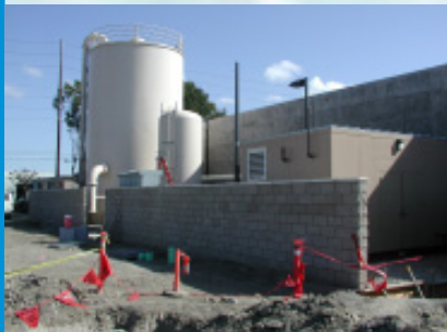
AWPF Air Gap Pump Station

The Unit I pipeline contractor has successfully completed hydrostatic testing of the entire pipeline and will complete the tie-in to the Unit II pipeline later this month. Project completion is scheduled for April 2007.