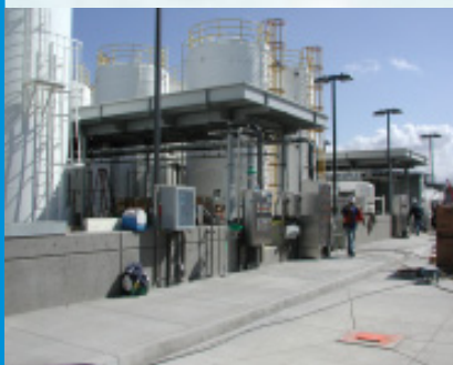
AWPF Chemical Unloading Area

The AWPf contractor continues finish work on the east and west side microfiltration buildings. Installation of mechanical piping continues in the west microfiltration galleries. Initial commissioning activities have been completed in the east galleries and are beginning in the west galleries. Mechanical gallery piping work continues in the reverse osmosis area. Electrical testing in switchgear, motor control centers, and variable frequency drives continues throughout the facility in all areas. Permanent power has been provided at the 12KV level in the microfiltration, reverse osmosis and ultraviolet light areas. Energization of transformers and motor control centers has taken place in the microfiltration area and power has been established to the control room. Commissioning activities at the air gap pump station and screenings facilities will begin in early April. Plant start-up and overall project completion is scheduled for November 2007.