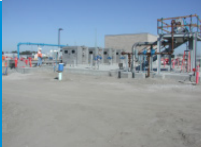
AWPF Screenings Facility