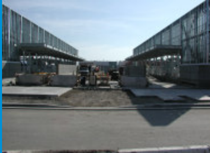
AWPF East and West Microfiltration (foreground) Reverse Osmosis Building (background)