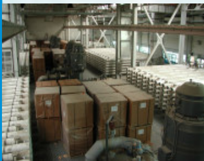
AWPF Reverse Osmosis Building (Membranes in Crates)

The AWPF contractor continues finish work on the east and west side microfiltration buildings. Installation of mechanical piping continues in the west microfiltration galleries and initial commissioning activities are continuing in the east galleries. Mechanical gallery piping work continues in the reverse osmosis area. Metal panel installation continues at the lime building and post chemical treatment building. Electrical testing in switchgear, motor control centers, and variable frequency drives continues throughout the facility in all areas. The east microfiltration building was successfully energized at the 12 KV level this past week. Demolition of the Water Factory 21 buildings has been completed and the backfilling of the void left by the old structures has been completed as well. Plant start-up and overall project completion is scheduled for November 2007.