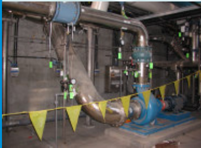
AWPF Microfiltration Commissioned Equipment

The Unit I pipeline contractor has successfully completed hydrostatic testing of the 78-inch pipeline and will begin testing the 54-inch line next week. The contractor also is working on punch list items. Project completion is scheduled for April 2007.