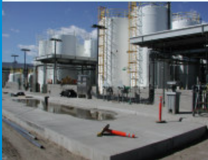
AWPF Chemical Unloading Area

The AWPF contract includes all structures, piping and facilities that are within the boundaries of the OCWD and OCSD treatment site located at Ellis Avenue and Ward Street in Fountain Valley. Facilities include the Screening Facility at OCSD's Plant No. 1, the 96-inch diameter influent pipeline from the Screening Facility to Microfiltration Facility, Microfiltration Facility (86 mgd filtrate), Microfiltration Break Tank, Reverse Osmosis Facility (70 mgd permeate), UV System (70 mgd product), Chemical Feed/Lime Stabilization System, Product Water/Barrier Pump Station, and all yard piping. Included in the AWPF contract will be all electrical, instrumentation, and process control systems (PCS) associated with each facility. The MF and UV equipment was pre-selected by the District and their contracts were assigned to the Contractor.