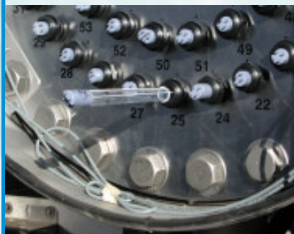
AWPF Ultraviolet Light Treatment Lamp