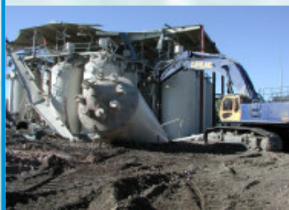
AWPF Demolition of Water Factory 21 Carbon Building