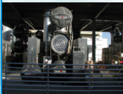
AWPF Ultraviolet Light Treatment Train