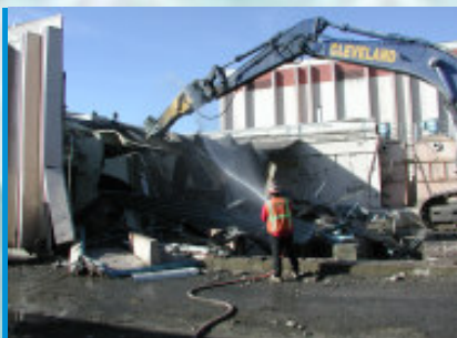
AWPF Demolition of Water Factory 21 Reverse Osmosis Building